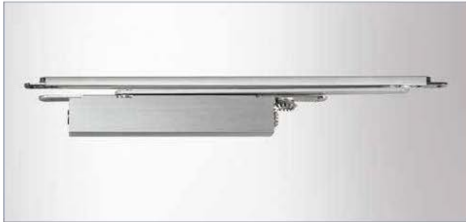
GEZE Boxer 2V