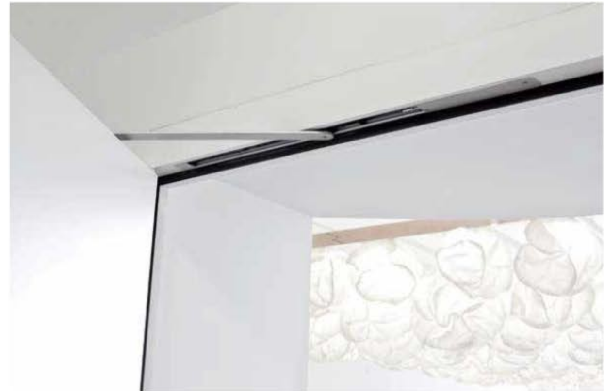
VitraHaus, Weil am Rhein, Germany