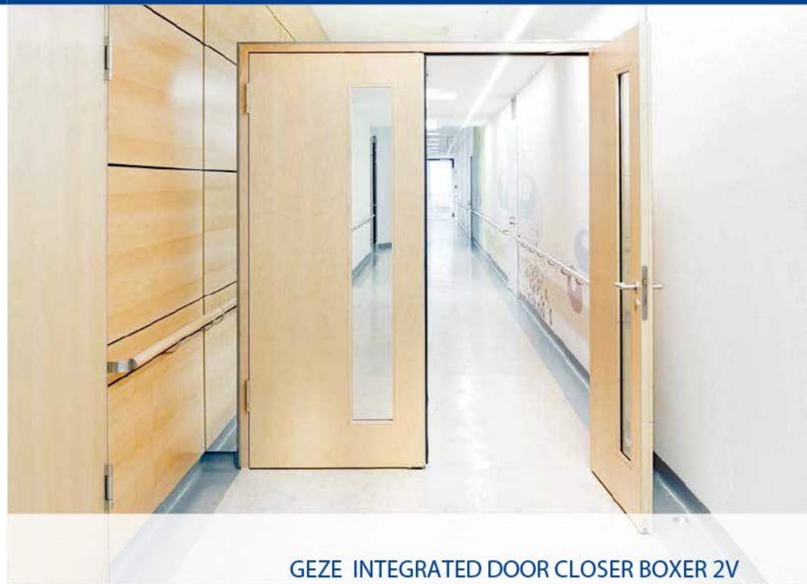
GEZE INTEGRATED DOOR CLOSER BOXER 2V 盖泽隐藏式闭门器 BOXER 2V